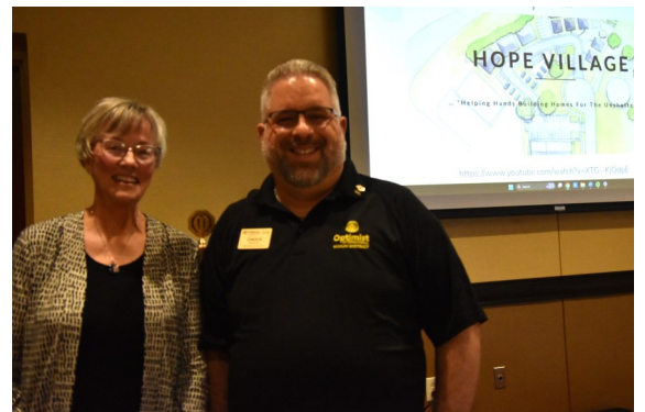
August 16, 2024 Graham Motor Museum