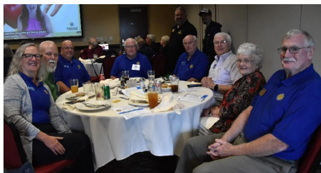
Hallie Optimist Club members at 4th Quarter Convention.

The Hallie Club has donated almost $100,000 to students since 2001 in college scholarships. Fall and winter events include Chippewa Falls Oktoberfest and Breakfast with Santa.