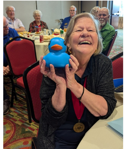
August 17, 2024 4th Quarter Convention Holiday Inn South, Eau Claire