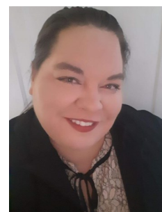
Lt. Gov. Brenda Wolff

The Green Bay Preble Optimist Club just completed their annual donation process where $90,000 was given to 23 non-profit groups in their area. Each member was allocated $2,000 to be given to the group of their choice. As part of the $90,000, $10,000 was used for scholarships at NWTC and funds were also used to support Kids with Disabilities Night at Bay Beach, Shop with a Cop, bike helmets for kids through childhood safety and Cops & Bobbers event with the