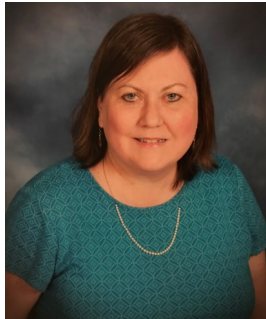
Lt. Gov. Colleen Sheahan

The Brillion Optimist Club annual Electric Parade will be held June 7 at 8:30 pm in conjunction with Brillion Fest weekend activities. The club is hoping for the return of eight marching bands, four of those are contracted (cost-share) in coordination with the Appleton Flag Day Parade, held on June 8.