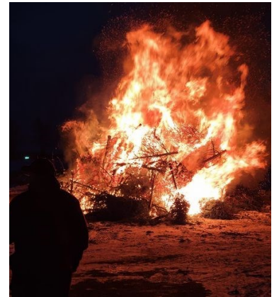
Tree burn in Antigo

Antigo Optimists On January 23, the Antigo club held their annual Tree Burn and Food Pantry Food Drive. It took place at the Antigo High School on the southeast edge of the gravel parking lot ( see photo below ). Hot dogs and hot chocolate were available on this beautiful evening. Baskets were set up to collect food and monetary donations to the Antigo Area Community Food Pantry.