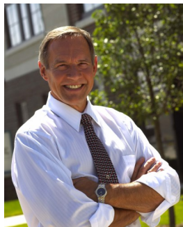
Lt. Gov. Tom Binish

Appleton Noon Optimist Club: What has Appleton Noon Optimist Club been up to? The short and sweet answer is raising money and giving it back to programs that support youth: Boys & Girls Club of the Fox Valley ($2,000), YMCA of the Fox Cities ($5,000), Greenville Civic Club (500), Fox Cities Salvation Army ($500), and Friends of the Butterfly Garden ($1,500). Those dollar amounts and commitment are due to hard work and devotion to Optimism...something the Appleton club is never short on.