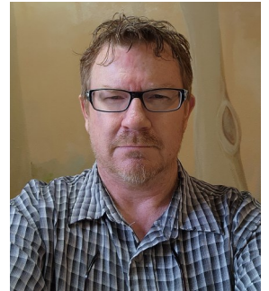
Lt. Gov. Shannon Dalton

Antigo Optimists On January 23, the Antigo club held their annual Tree Burn and Food Pantry Food Drive. It took place at the Antigo High School on the southeast edge of the gravel parking lot ( see photo below ). Hot dogs and hot chocolate were available on this beautiful evening. Baskets were set up to collect food and monetary donations to the Antigo Area Community Food Pantry.