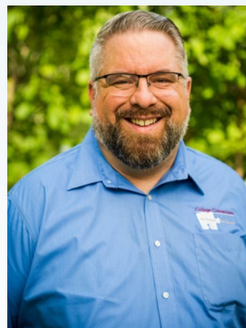
2023-24 Governor Chuck Erickson